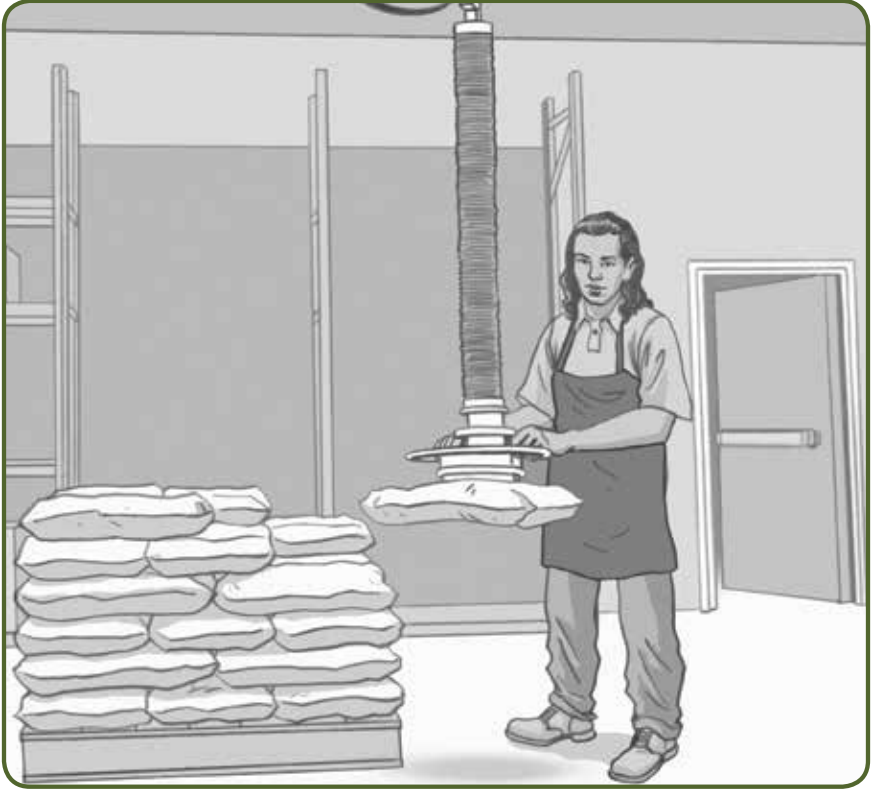
Figure 9 shows an employee operating an overhead vacuum or air hoist to move large bags of materials to flat carts or pallets (not shown). A vacuum lift device can alleviate the repetitive stress of lifting and moving of unstable materials. A main advantage is the lifting task can be done in less time by nearly any employee regardless of size and strength, thus increasing productivity.