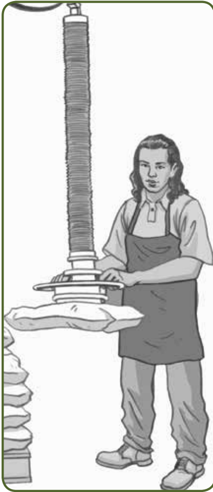
Figure: An employee operating a pneumatic lift and moving device. More details on Page 11, Figure 9.