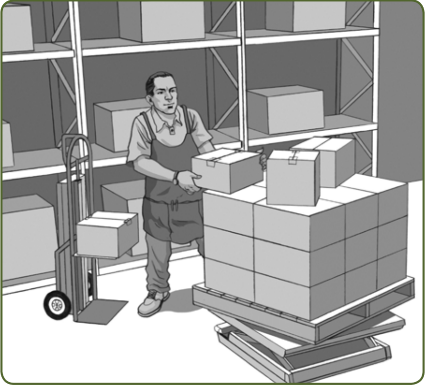
Figure 5 shows an employee unloading boxes from a pallet onto a powered adjustable handcart. The pallet is resting on a rotating and adjustable base that may be adjusted mechanically or pneumatically to set the height at waist level. The turntable minimizes reaching across or walking around the pallet.