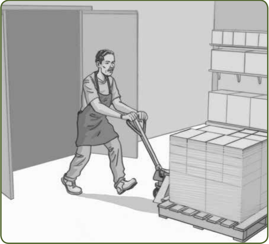
Figure 10 shows an employee pushing a manual pallet jack through the doors separating the stock area from the sales area. Pallets jacks or trucks are designed to lift and move a pallet. Although the pallet is able to hold large amounts of stock, thus reducing the number of trips between the back room and sales floor, pallets can pose a trip hazard to those in the immediate area, as well as blocking customers' access to the products.