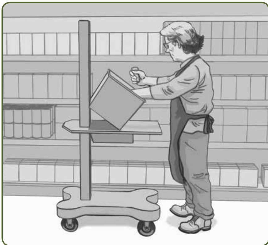
Figure 13 shows an employee stocking small goods from a tote (container) held in position by the stocking cart. By tilting the tote, awkward postures involving the shoulders, arms, and wrist are reduced, which lessens muscle fatigue and improves productivity. This type of stocking cart is particularly useful in stores where small items are stocked and sold, such as in the health and beauty aids departments in grocery stores.