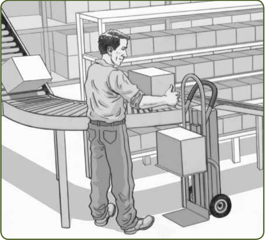
Figure 3 shows an employee who is removing boxes from a conveyor to load on a two-wheeled, self-adjusting handcart. Handcarts of this type are used frequently in moving beverages and containers of similar weights. In addition to saving time, adjustable handcarts reduce bending by keeping the load at or near waist level. Most adjustable handcarts operate with a spring or counterbalancing system.