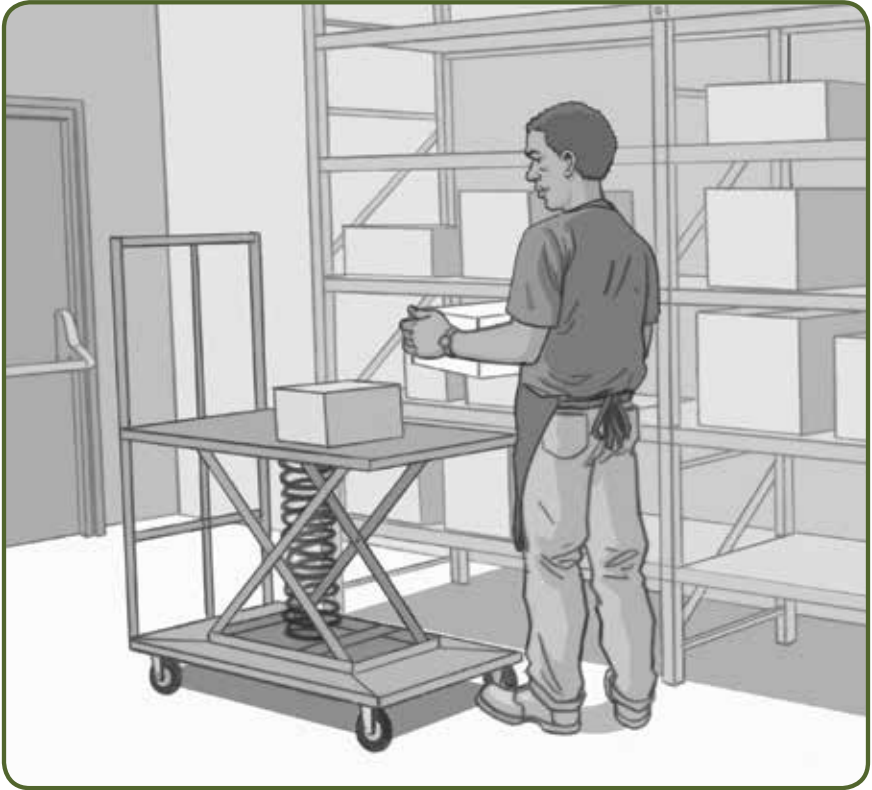
Figure 6 shows an employee unloading onto the storage shelves from a flat cart, outfitted with a spring-loaded platform. The intent of this device is to reduce excessive bending in loading and unloading materials located at or near the bottom of the flat cart. Best practices suggest stocking lighter weight goods on the lower level shelves. Knee pads are also an option if kneeling is required to stock lower shelves.