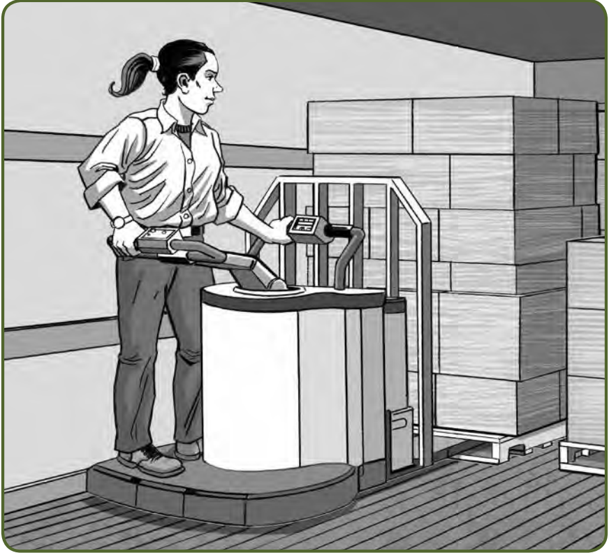
Figure 1 shows an employee unloading a trailer stocked with pallets of merchandise using a powered-pallet mover with a riding platform. Although, the device reduces the risk of material handling injuries, it does pose an added risk of a contact-with-object injury, such as bumping into the side of the trailer. Training is required to enable the operator with a loaded pallet to move safely across the loading dock's threshold into the facility's receiving area.