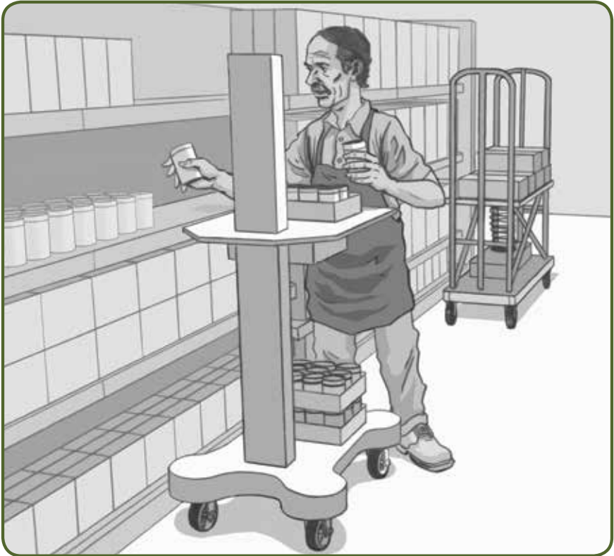
Figure 11 shows an employee with the aid of a stocking cart placing products on the store shelves using both hands, which increases his efficiency. This device was also designed to reduce excessive bending, holding, and reaching when stocking shelves. The top shelf slides up and down to keep the shelf at a better position for stocking shelves, while minimizing excessive bending.