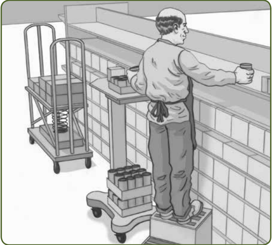
Figure 12 shows an employee also using a stocking cart. The man is stocking the top shelf and is able to keep the extra stock on the shelf of the stocking cart, which has been raised to its top position. Two hands are being used for stocking, as there is no need to hold the carton in one hand and stock with the other.