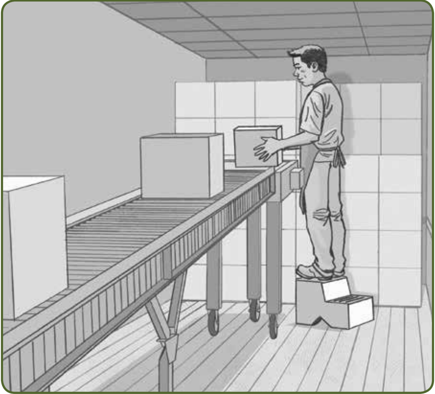
Figure 2 shows an example of a height-adjustable conveyor. With this type of conveyor, one person can do what two or more individuals normally do in unloading a trailer. Height adjustable conveyors can also reduce extreme bending and allow the boxes to be placed on the conveyors rather than dropped which could damage the container and/or contents. A sturdy step stool or platform is needed to reach the top levels of the interior of the trailer, which range from 7.5 feet (2.3 m) to 9.0 feet (2.7 m) high.