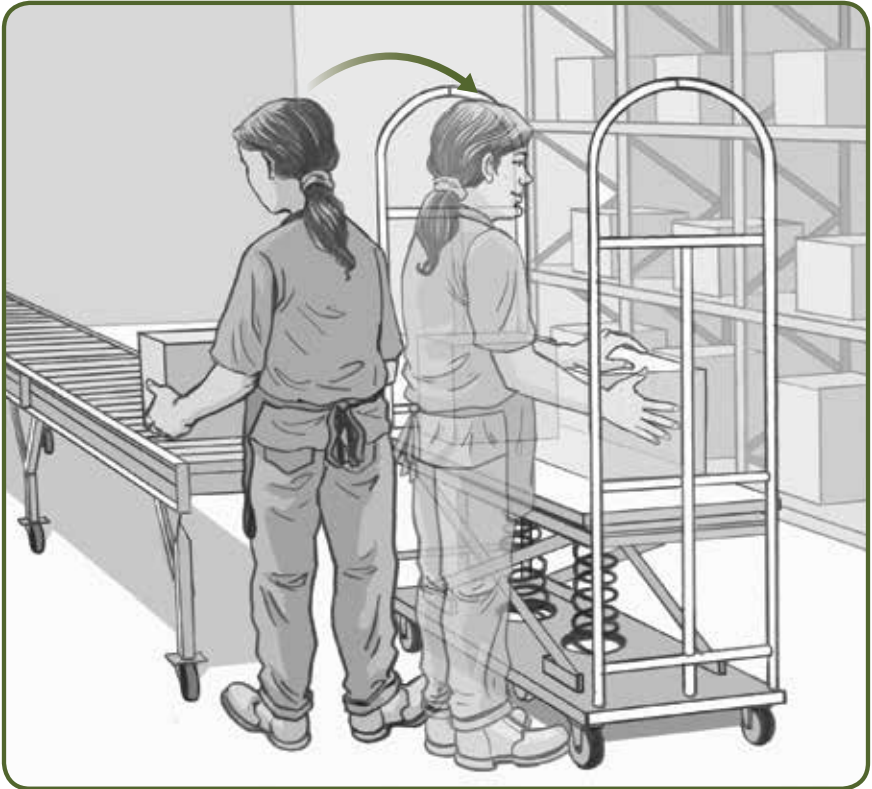
Figure 4 shows an employee in two positions as she unloads boxes from a conveyor onto a U-Boat platform truck in which a spring-loaded platform has been added. In the first position she is grasping the box. In the second position she turns her feet and body to face the platform truck. The U-Boat outfitted with spring loaded platform is designed to reduce bending by keeping the load at or near waist height either when loading or unloading containers. The narrow platform deck reduces excessive reaching.