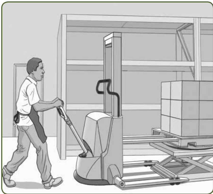
Figure 7 shows an employee with a battery powered pallet stacker picking up a full pallet. The full pallet is resting on a height-adjustable, pallet-loader table. The task here is either to move the full pallet to the sales floor or to move the pallet to a storage area away from a busy work area. The pallet stacker is designed to place a full pallet on a shelf for easy retrieval at a later time.